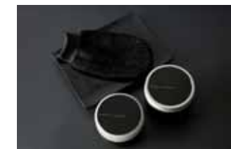
noir of hamman