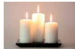
thoughts of light