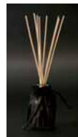
essences and diffusers